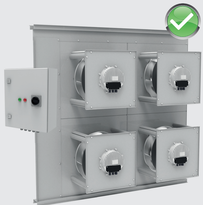
Efficient ECFanGrid as retrofit solution for the replacement of e.g. older belt driven fans. The ECFanGrid Retrofit KIT includes all mechanical parts: fans, cabinet, grid and screws.